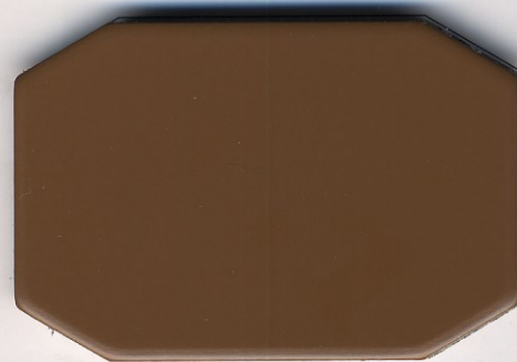
WFC 4119 暖黄(warm yellow)