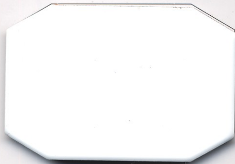
NPET-308 纯白(pure white)