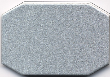
NPET-301 亮银(bright silver)