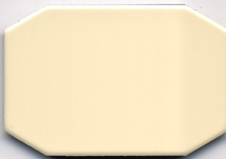
NPET-359 乳黄(cream yellow)