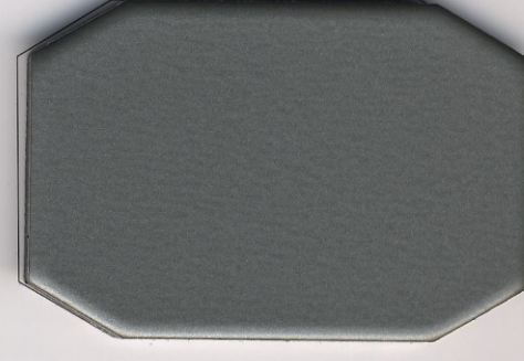
WFC 428 银色(silver)