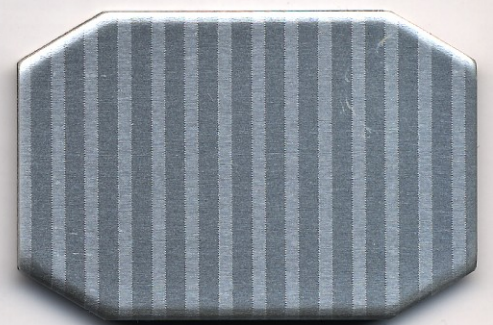
NPET-363 阳极氧化(anodic oxidation)