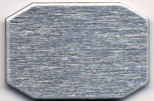
NPET-360 银拉丝(brushed silver)