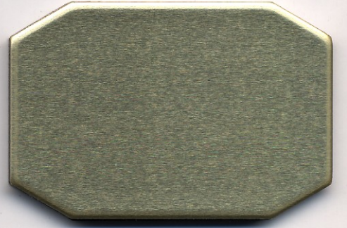
NPET-357 金拉丝(brushed gold)