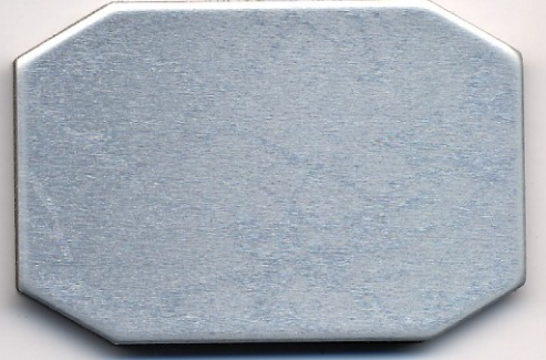
NPET-354 铁树银花(Tieshu Yinhua color)