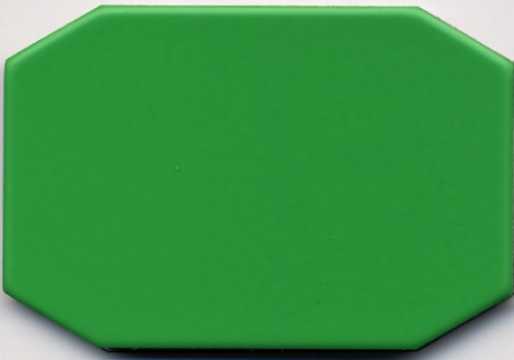
NPET-355 苹果绿(apple green)