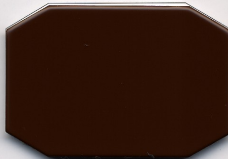
NPET-356 深棕(dark brown)