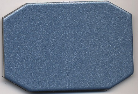
NPET-345 蓝银(blue silver)