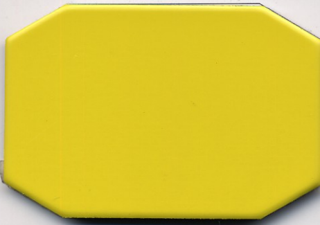
NPET-352 鲜黄(vivid yellow)