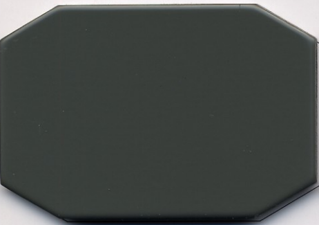
NPET-358 深灰(dark grey)