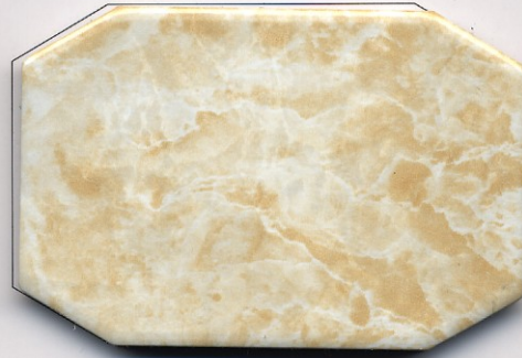
NPET-353 石纹(wooden grain)