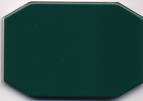
NPET-331 宝绿(dark green)