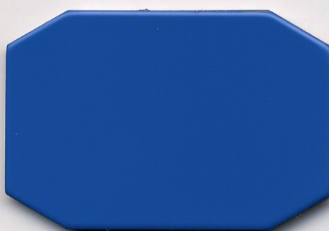
NPET-361 天蓝(sky blue)