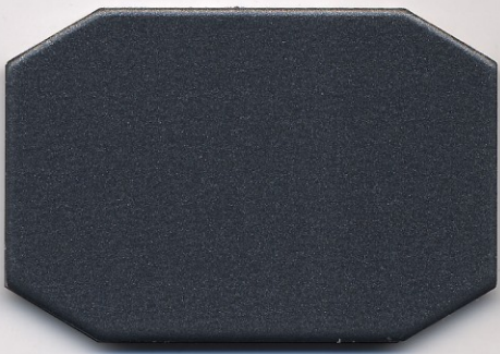
NPET-344 淡光银(light silver)