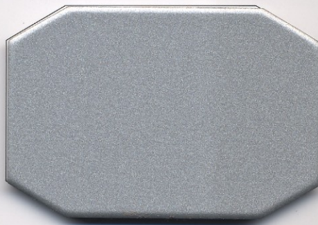
NPET-302 白银灰(mat silver)