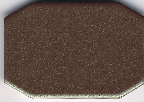
WFC 4135 幻彩金(chameleon golden)