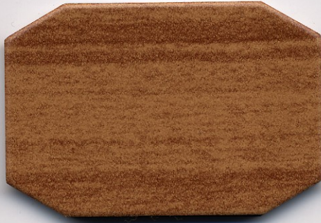
NPET-350 木纹(wooden grain)