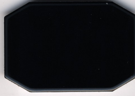
WFC 4114 黑色(black)