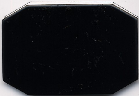
NPET-330 纯黑(pure black)