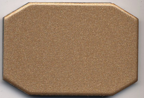
NPET-342 红金(red golden)