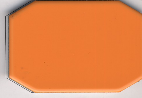
WFC 4111 橙黄(orange)