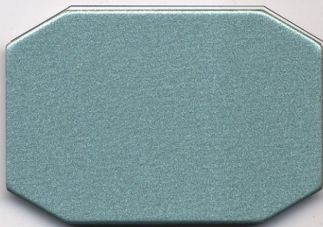
NPET-318 玉色(jade green)