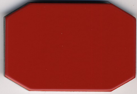
WFC 404 绯红(crimson)