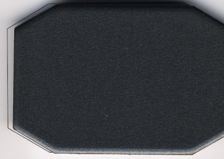
WFC 4107 深灰银(dark grey silver)