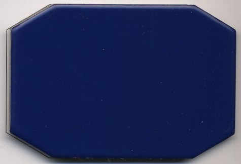
NPET-306 深鲜兰(ultramarine blue)