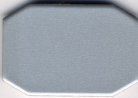
WFC 402 白银灰(mat silver)