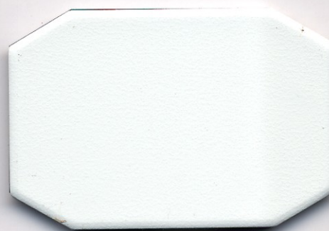
NPET-362 抗刮白(anti-scratched white)