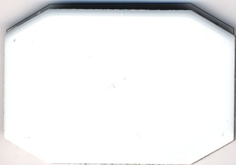
WFC 406 白色(white)