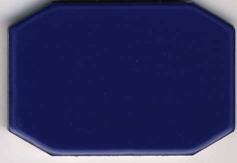
WFC 4116 鲜蓝(bright blue)