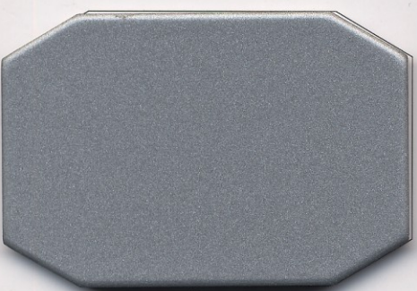
NPET-346 紫中银(purple silver)