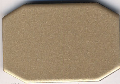
WFC 4112 金色(golden)