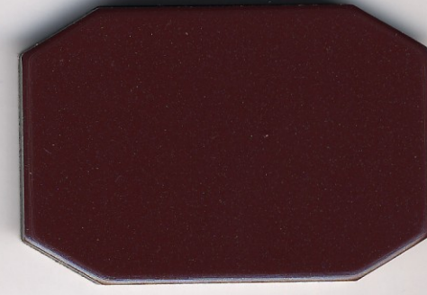
WFC 4136 紫红银(chameleon mauve silver)