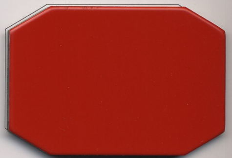
NPET-328 鲜红(bright red)