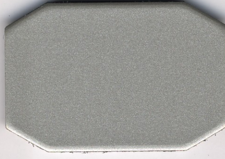
WFC 411 香槟银(champagne silver)