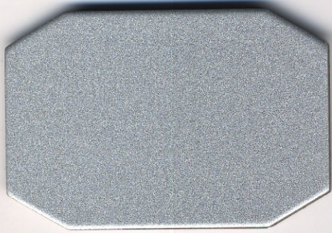
WFC 401 亮银(bright silver)