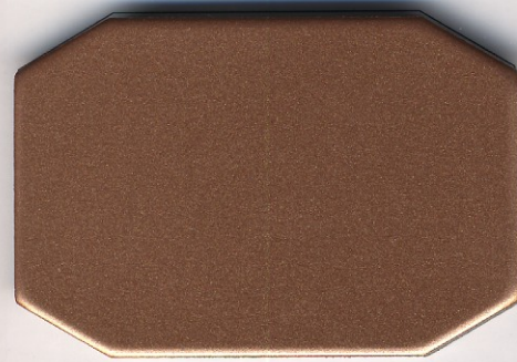
WFC 453 棕黄(brown)